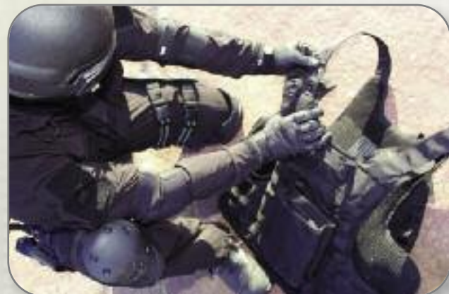
A magnitude of pouch placement makes this the MOST VERSATILE ARMOR SYSTEM ever!

The BLACKHAWK! helmet features a proprietary design and has been tested to both the HPWTP-0401B Test Procedure and the Military Standard 662F for fragmentation.