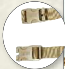
Detail of side release buckles