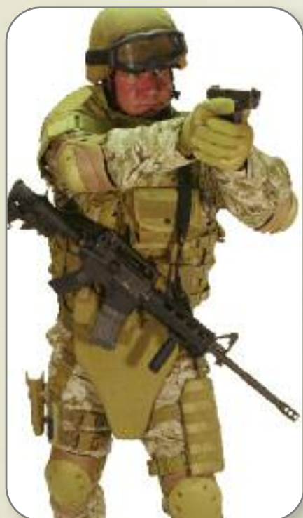
CUSTOMIZE YOUR VEST FOR THE MISSION