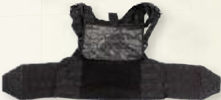
ADJUSTABLE SIDE PANELS FOR GIRTH